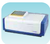
UV/VIS Spectro 2080+ Double Beam

Analytical Technologies is synonymous for offering technologies for doing analysis and is the Fastest Growing Global Brand having presence in at least 96 countries across the global. Analytical Technologies Limited is an ISO:9001 Certified Company engaged in Designing, Manufacturing, Marketing & providing Services for the Analytical, Chromatography, Spectroscopy, Bio Technology, Bio Medical, Clinical Diagnostics, Material Science & General Laboratory Instrumentation. Analytical Technologies, India has across the Country operations with at least 4 Regional Offices, 6 Branch Offices & Service Centers. Distributors & Channel partners worldwide.